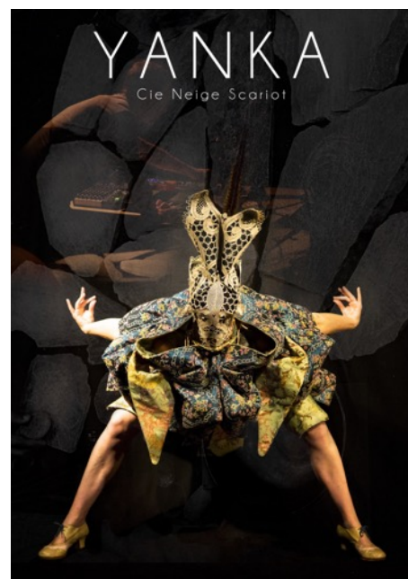
YANKA created 2022

With support from: the city of Charleville-Mézières, the County Council of les Ardennes, DRAC Grand Est for PAG Danse « Matière à danser » (school project). Artistic residences: Pôle danse des Ardennes (08), le Forum (08), la MCL Ma Bohème (08), le Garage à Rennes (35).