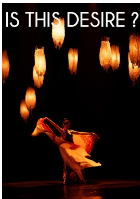
IS THIS DESIRE ? created 2018-2019

Production: Yalla Flamenco Coproductions: Le Manège-Scène Nationale de Maubeuge (59) and le Pôle Danse des Ardennes (08). With support from: the city of Charleville-Mézières, the County Council of les Ardennes, the Grand Est region Artistic residences: Le Manège-scène nationale de Maubeuge (59), Pôle Danse des Ardennes (08), Gare Numérique de Jeumont (59), CSC André Dhôtel (08)