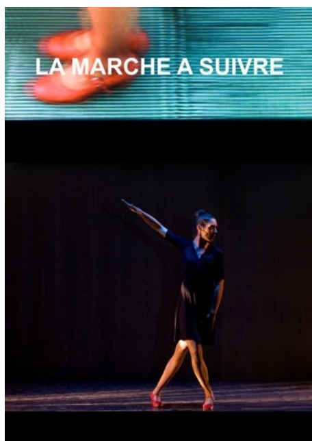
LA MARCHE À SUIVRE created 2014-2015

This show takes us on a rhythmic road movie, set between tradition and modernity, while a guitar plays electrifying rock with deep Flamenco vocals. Between these 2 points, a dancer performs her own path, her own steps, in order to connect both worlds, thus creating a sonic, visual, and choreographic object, totally unique in its form.