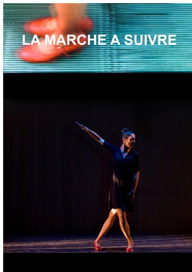
La marche à suivre: dance, live music & video 50 mn