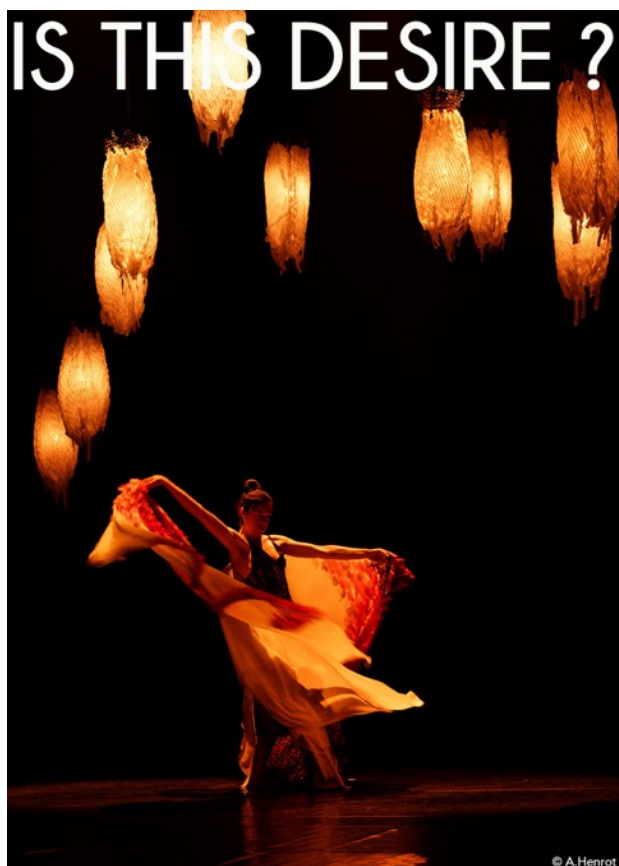
Is this desire ?: dance 60 mn